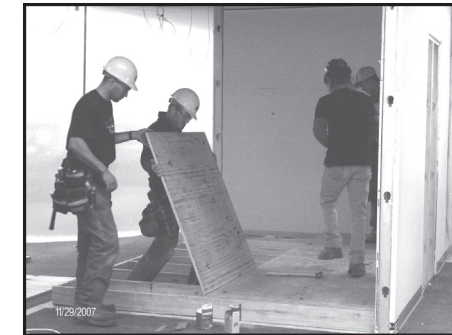
Workers from Brown Construction work to set the new platform that will be the reception desk.

Funds are still needed for the projects, which will total $200,000. If you would like to support the building and renovation project, please call the Siouxland Red Cross at 712-252-4081 or 800-340-4081.